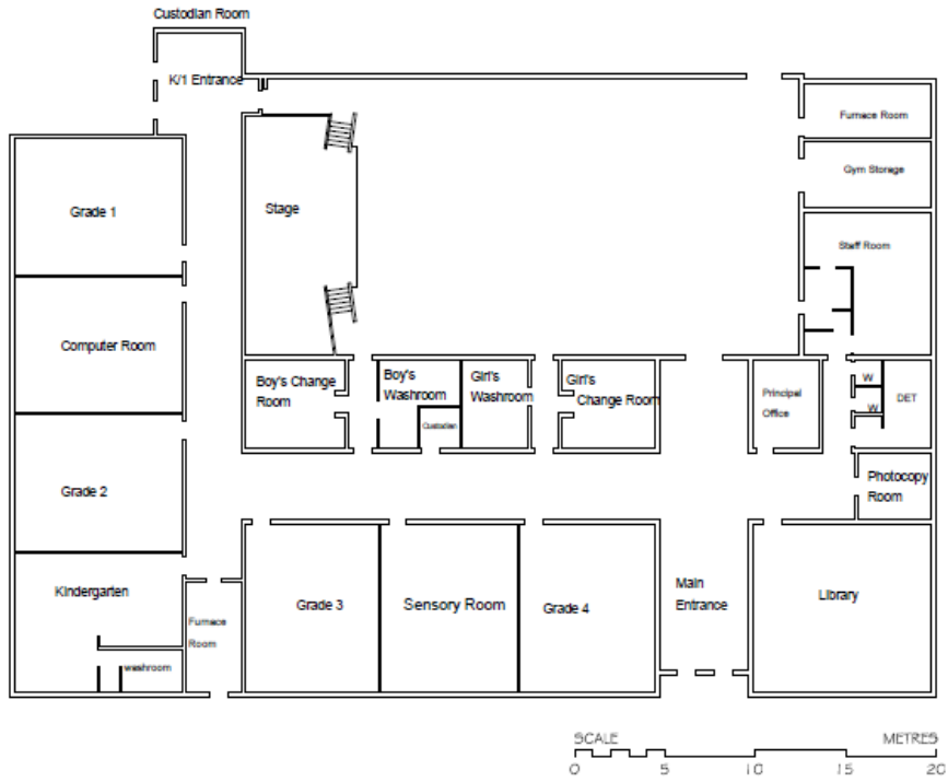
CARROT RIVER ELEMENTARY SCHOOL